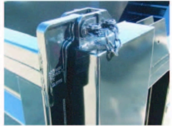
Tailgate hardware is cast steel with grease fittings.

Air tailgate latch, 36" cab shield, 8 gauge sides, 3/16" one piece floor, 6 panel tailgate, Center coal door, Grip strut walkrod, Horizontal bracing, Asphalt chute, Front corner posts