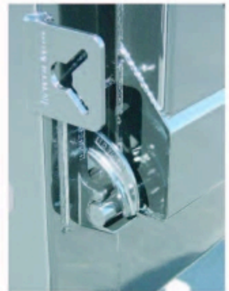
Lower tailgate latch is 4140 grade cast steel. Latch pivots are bushing type width 1 1/4" diameter pin for extra support.