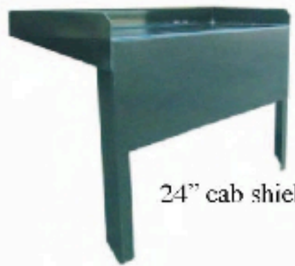
24" cab shield

All Godwin bodies are constructed of 10 gauge ASTM-A 607 grade 50 material or equal to ensure durability and long life. To help our bodies maintain their durability and life they are also powder coat primed black standard. A 24" cab shield is standard equipment on the 300U and 500T.