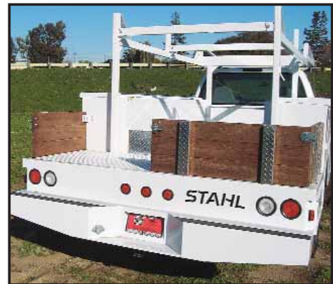
Stake racks easily remove for easy access into cargo area.